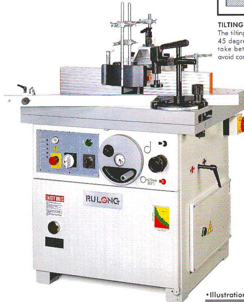
• Illustration shows SS-511MS

The tilting moulding unit can be tilted between 45 degrees and -5 degrees enabling you to take better advantage of your cutters and avoid costs of expensive and complex tools.