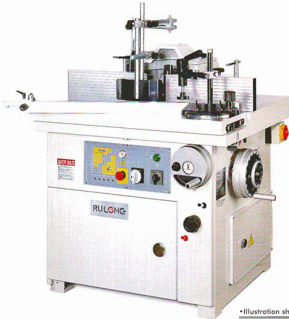
•Illustration shows SS-512TS